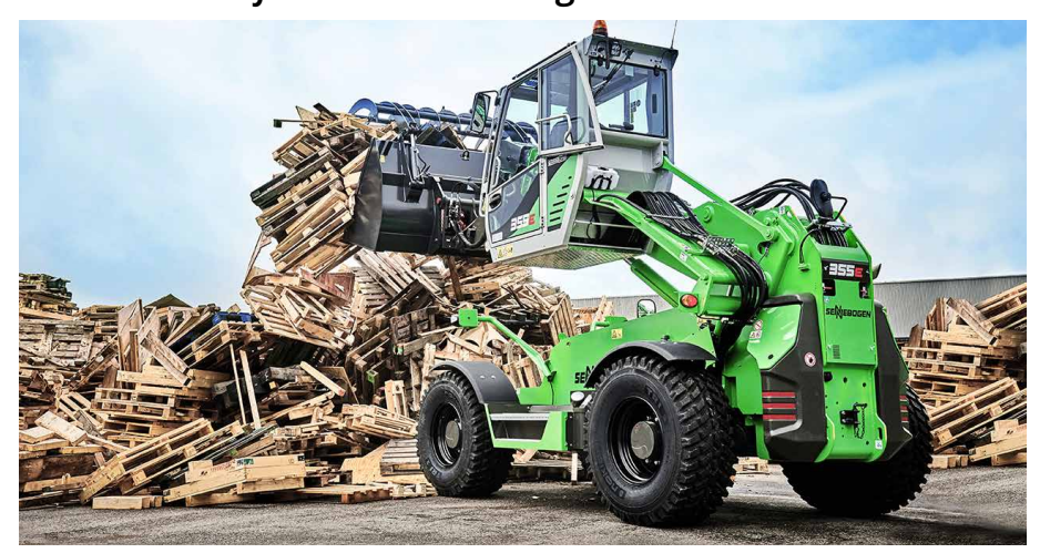
Air LGV90/C1 fitted to Sennebogen's new 355 E telehandler