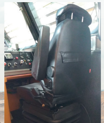
Air LGV120/C1 fitted to Scaler mining machine