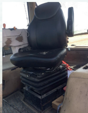
Air LGV90/CIAR TT fitted to John Deere 8400 tractor