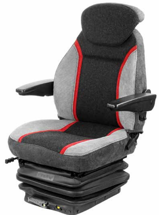
CS85/C1 with regain fabric

Options are plentiful with fabric versions in black or retro brown, PVC versions, turntables, back rest extensions, and heating, it really is the seat for all occasions.