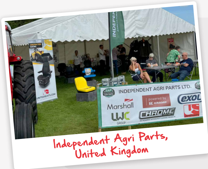
Independent Agri Parts, United Kingdom

Independent Agri Parts exhibited at the one day Drifffield Show which took place in Yorkshire , with around 20,000 people visiting the popular event.