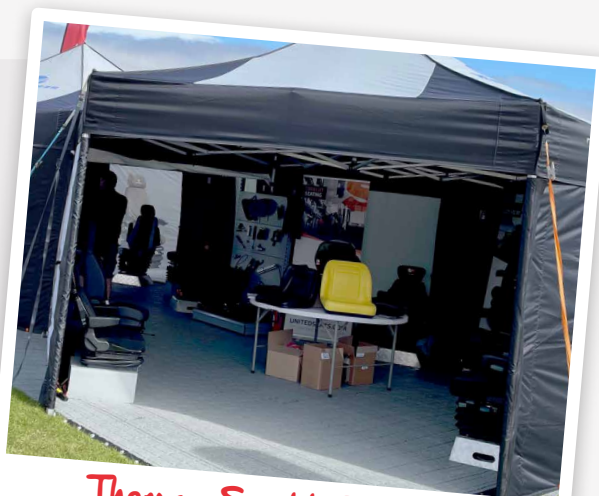
Thomas Scott Seating, United Kingdom

They had a large number of UnitedSeats on display from pans seats like the Mi600 to the Rancher Pro, MG120/C8 Pro with CDC brackets and the Voyager truck & bus seat which all were well received.