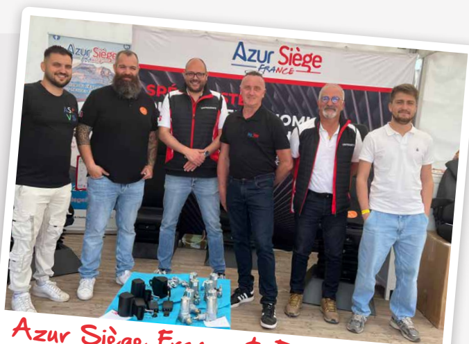
Azur Siège France & Rocco Pièces, France