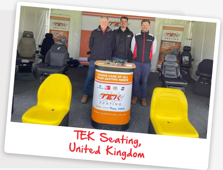
TEK Seating, United Kingdom

They had an excellent range of UnitedSeats on display which included the Rancher Pro with 12v heating, the Mi800 in Yellow, MGV84/C1 SM , CS85/C1 , CS85/H90 and many others.