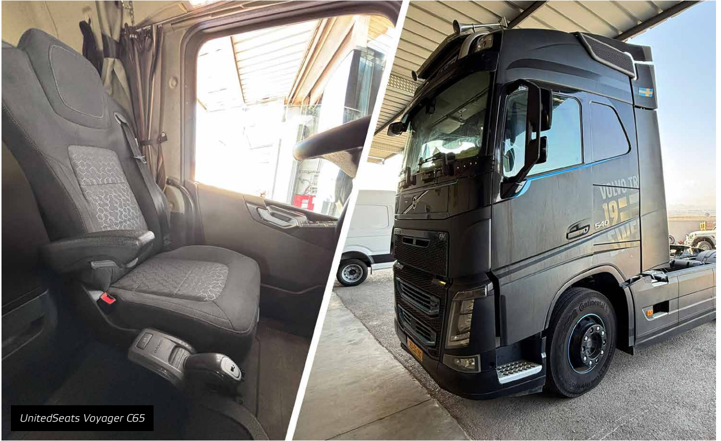
UnitedSeats Voyager C65